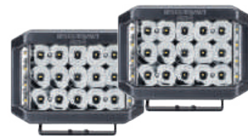
Eclipse 5x7 with Side Shooters