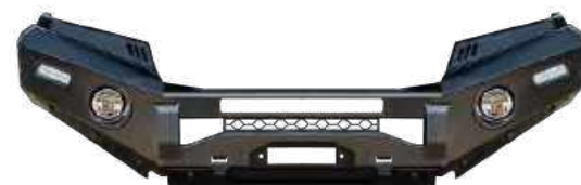
Premium Bull Bar No Loop