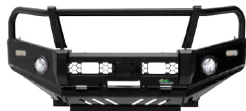
Commercial Deluxe Bull Bar