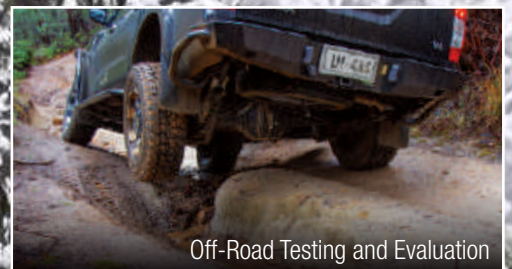
Off-Road Testing and Evaluation