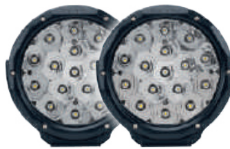
Blast 7" Spot or 7" Combo