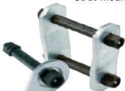
Shackles and Pins