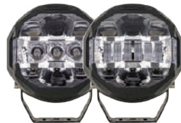
Scope 7" Spot or Combo