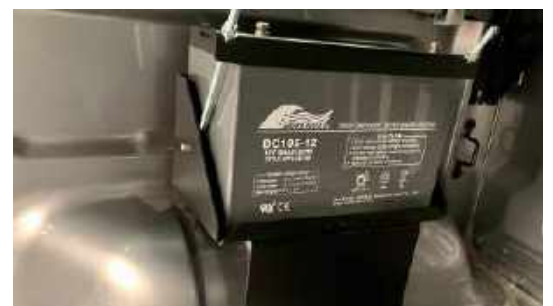
Universal Battery Tray