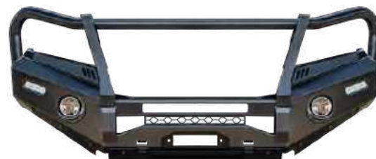
Premium Bull Bar

Nissan Australia recommend installation of heavy duty front coil springs when installing a bull bar - Aust Only * Low profile design retains ADAS radar in factory grille **Relocates ADAS radar into bull bar