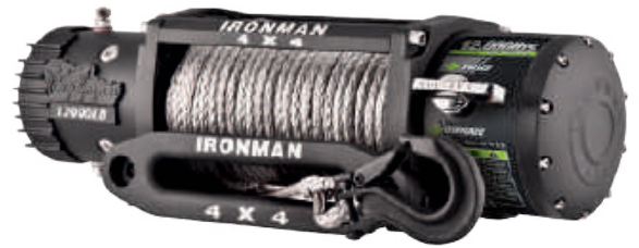
Synthetic Rope Winch