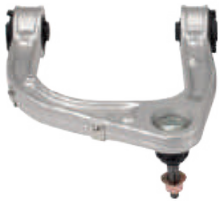
Upper Control Arms