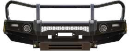
Commercial Deluxe Bull Bar