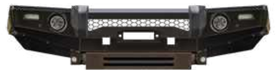
Proguard No Loop Bull Bar