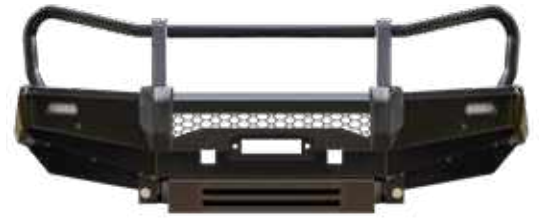
Commercial Bull Bar

• Standard Body Width - 1860mm • Narrow Body Width - 1780mm