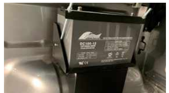
Universal Battery Tray