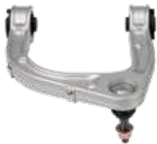
Upper Control Arms