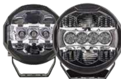
Scope 7" or 9" Spot or Combo