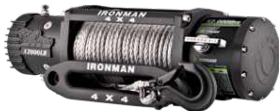
Synthetic Rope Winch