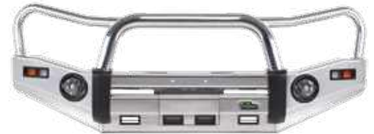
Aluminium Bull Bar