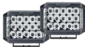
Eclipse 5x7 with Side Shooters