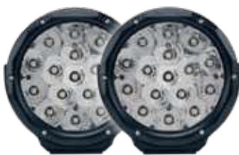
Blast 7" Spot or 7" Combo