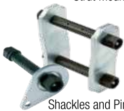
Shackles and Pins